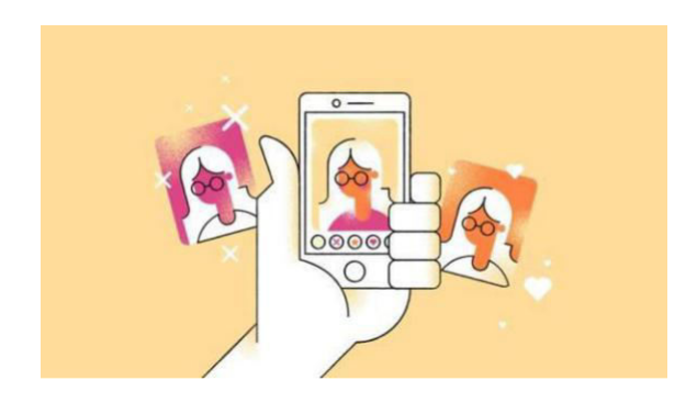
Fig5: Tinder Application Des ign

Tinder is a really s imple app to use. Just download it, set up an account or log in with your Facebook profile, specify the gender and age range of the people you'd like to meet, and how far you're prepared to travel to meet them. When Tinder finds people, who match those criteria it places cards on your screen that show a large photo of the person and tap this to see a short description they've written along with more photos.[9]